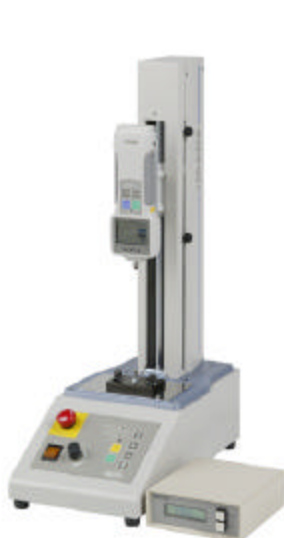
MV-500NII-E / MX-500N-E